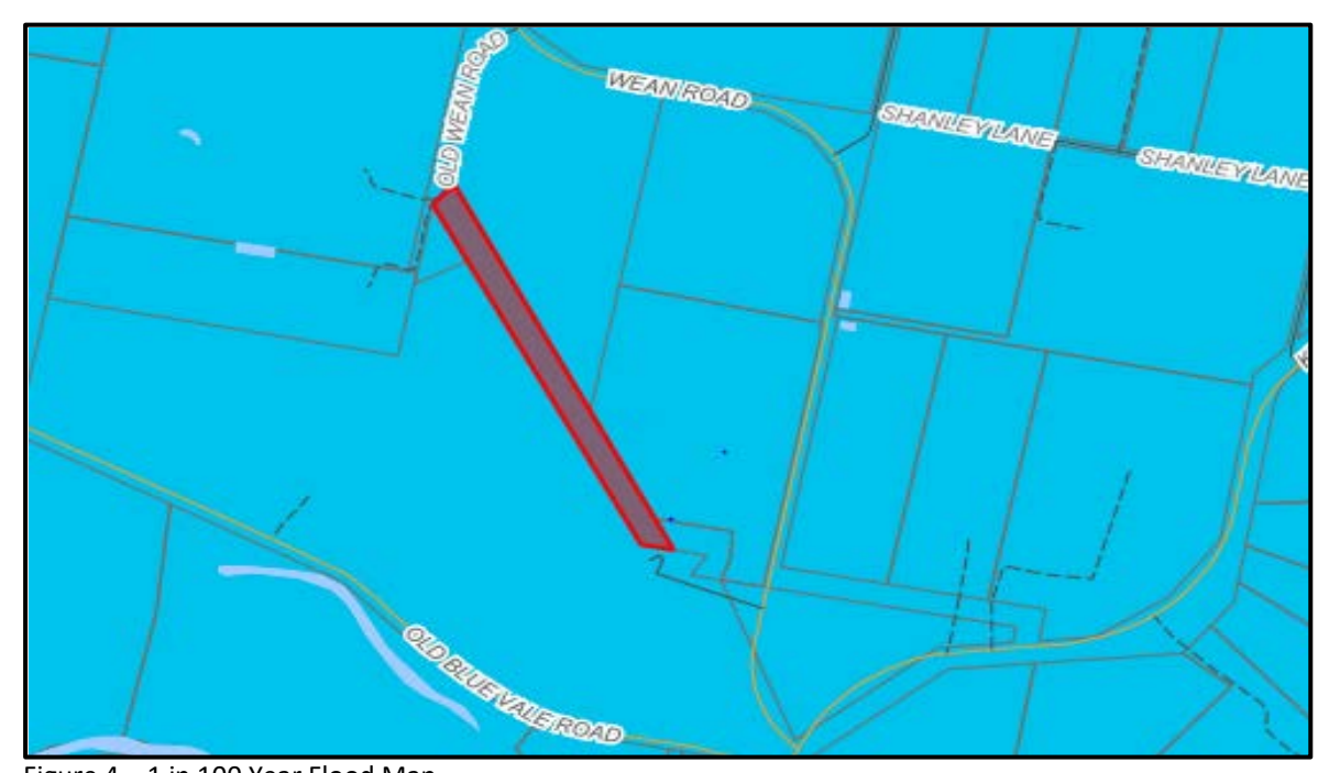
Figure 4 – 1 in 100 Year Flood Map