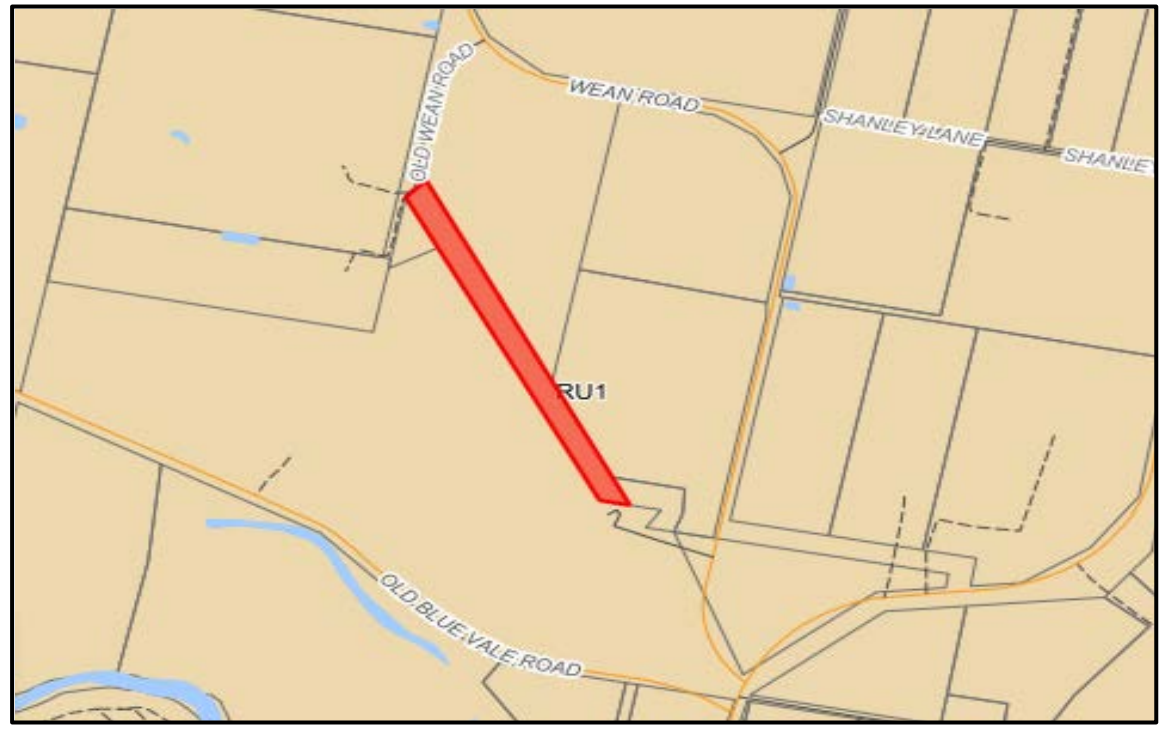
Figure 1 – Site Location

The proposed development is for the construction of an airport hangar at the Gunnedah Airport.